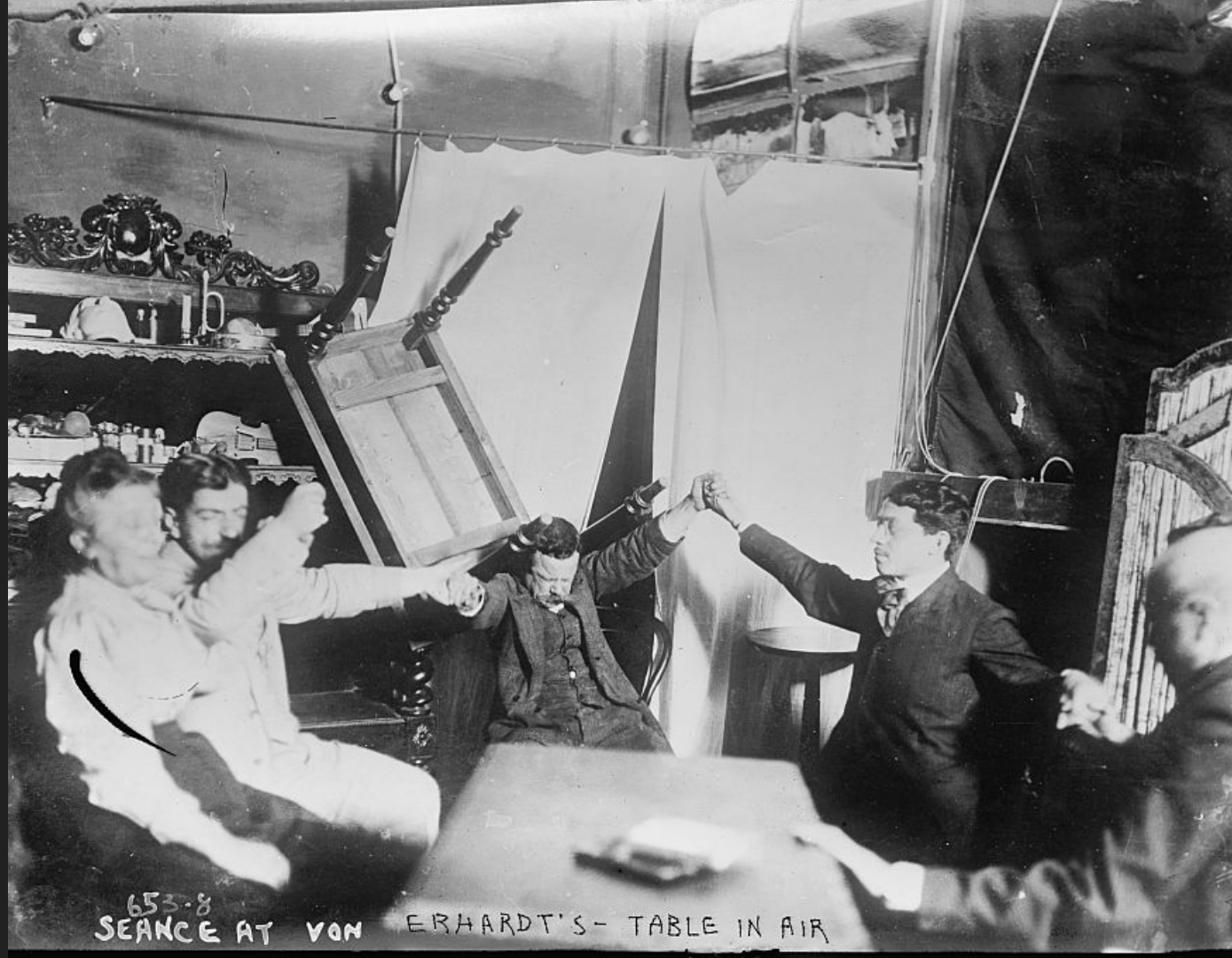
“Seance at von Erhardt's - Table in the air” [1909]

653-8 SEANCE AT VON ERHARDT'S - TABLE IN AIR