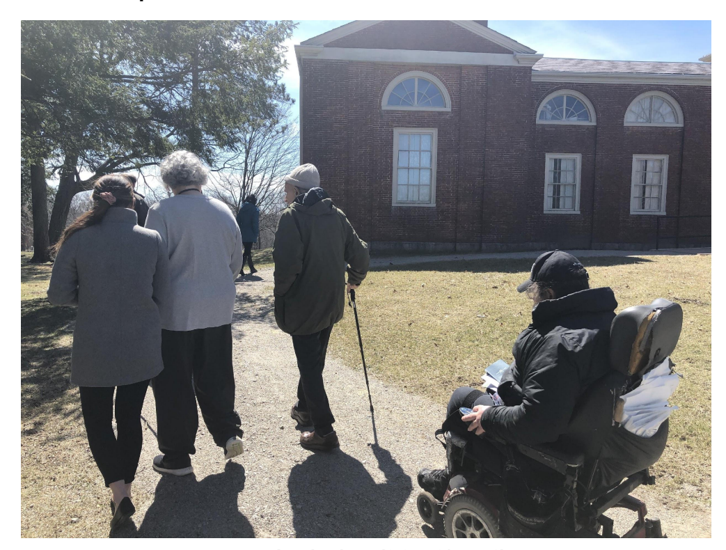
Include alt text/caption

Four User Experts head toward the Mansion's East Entrance ramp while facing into the sun