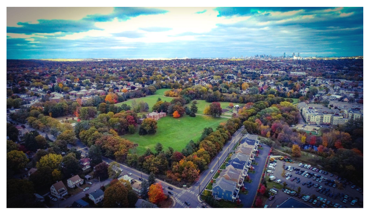
Aerial view of Gore Mansion & grounds in autumn, viewed from a drone.