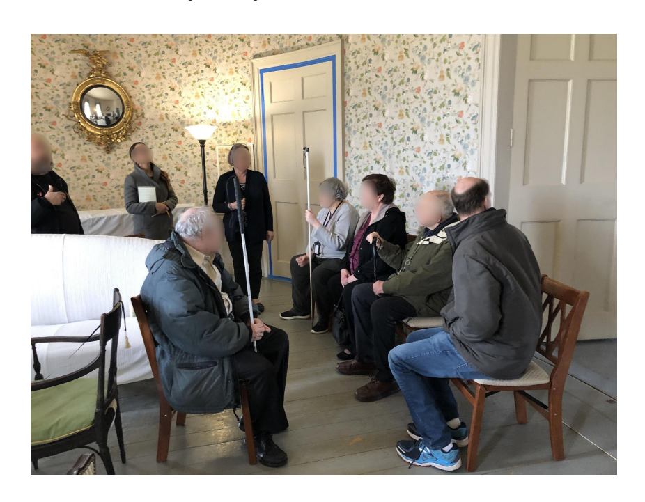
User Experts on a guided tour in the oval Withdrawing room