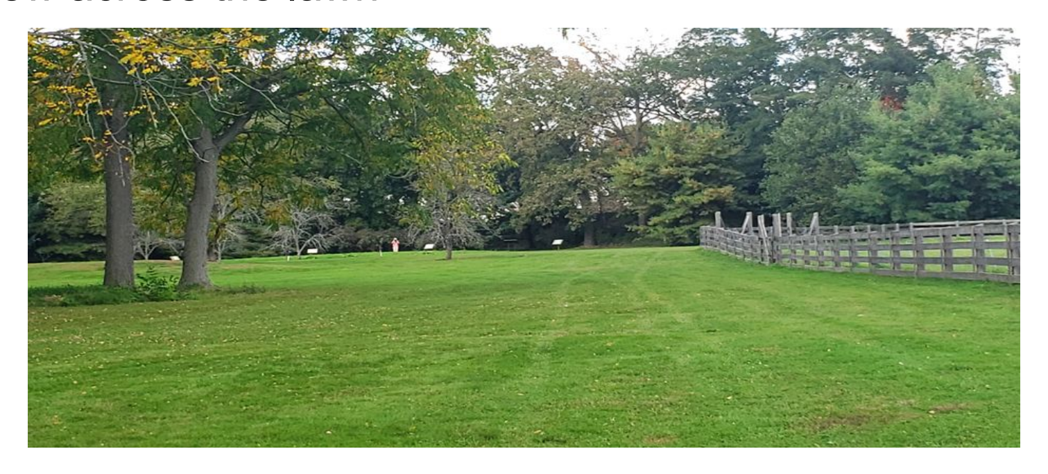
View of the green lawn with two panels in the background