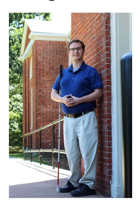
Left: Guide standing on accessible ramp of the mansion