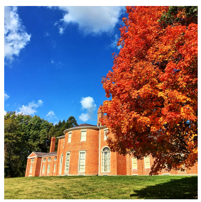
South Facade of the Gore Mansion in Fall