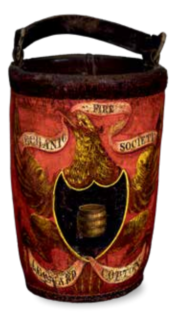
This fire bucket was owned by Leonard Cotton, who had many Puddle Dock properties in the 19<sup>th</sup> century. (2008.1a)